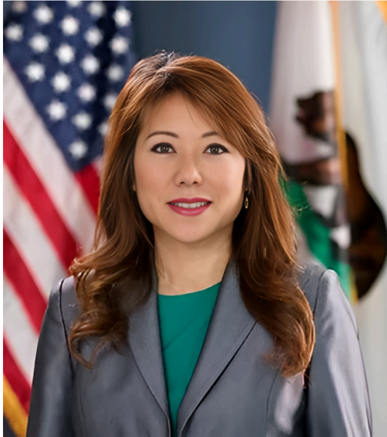
Fiona Ma California State Treasurer